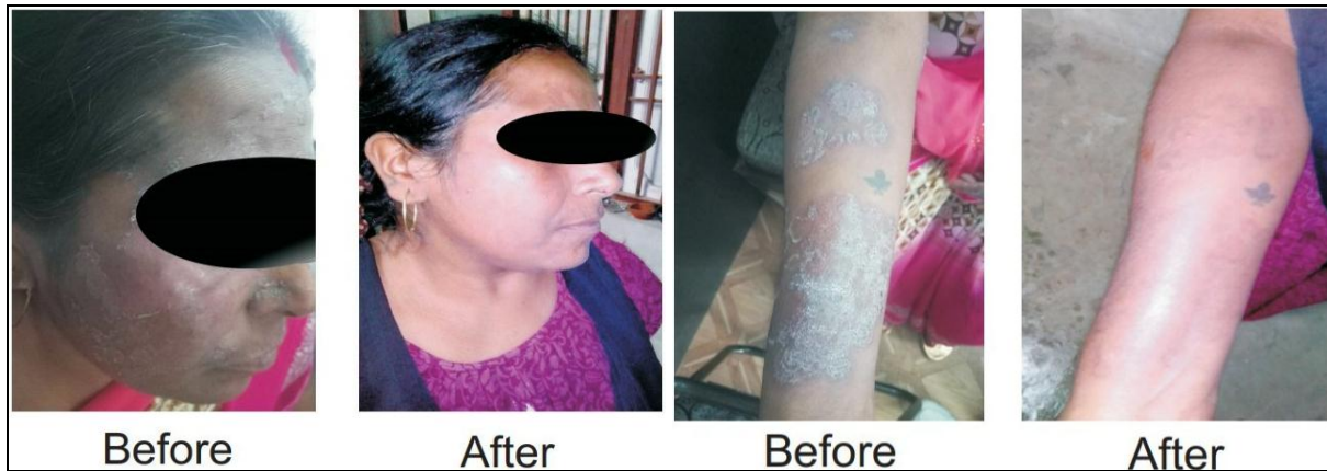
Figure 2: Characteristic symptoms of Psoriasis before and after treatment.